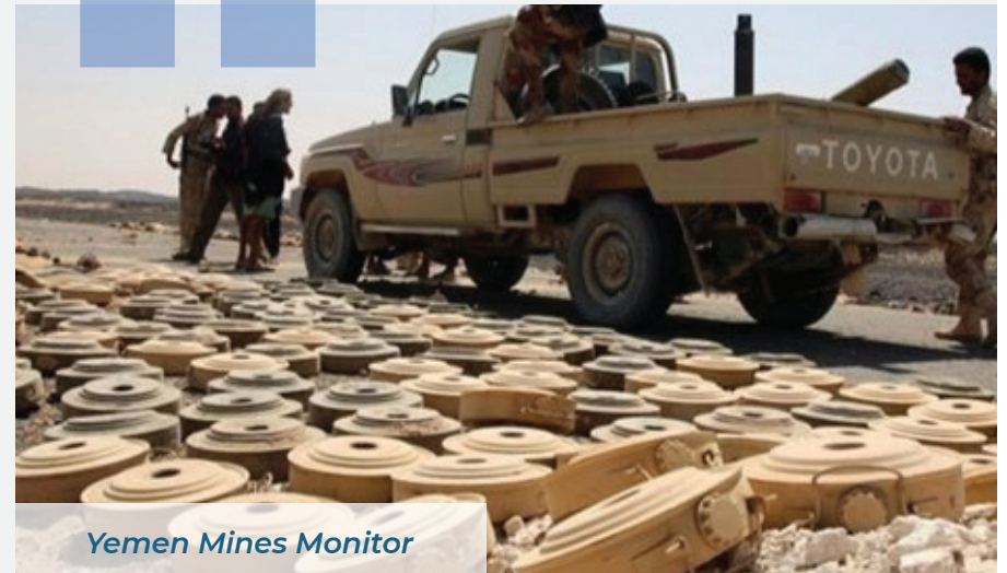
Yemen Mines Monitor

The Yemeni Landmine Monitor announced that 5 civilians had been killed and 6 others injured, including children and a woman because of the mines planted by the Houthi group in different governorates