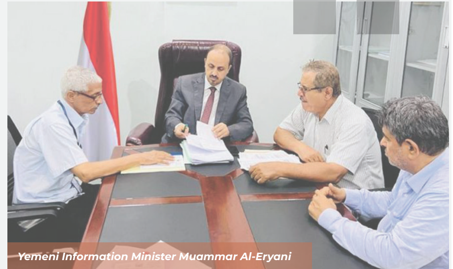
Yemeni Information Minister Muammar Al-Eryani

people were killed and 6 others were injured 8 after a hand grenade was detonated by a gunman in a public council in the Al-Makhadar district, north of Ibb governorate, in the center of the country. {The governorate is under the control of the Houthi group