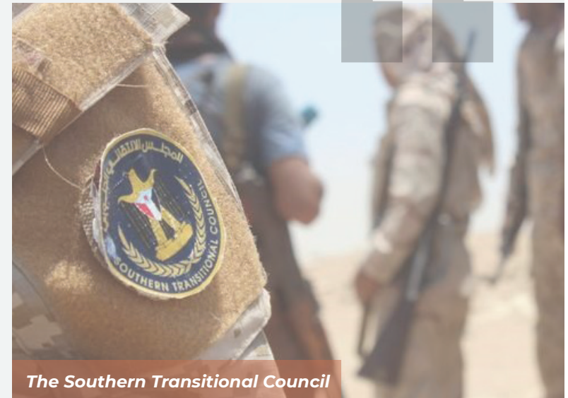
The Southern Transitional Council

The Southern Transitional Council (backed by the Emirates) launched a recruitment campaign in the governorates of Aden and Abyan (southern of the country) a week after the President of the Presidential Council, Rashad Al-Alimi, announced a committee to unify the military and security forces and integrate them into the Ministries of Defense and Interior